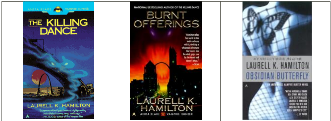
Book covers from Amazon.com.

always ends badly for the humans. It's a rule" ( Circus of the Damned 328).